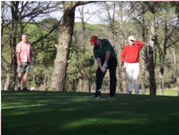
Les just after impact. luv the action on the shaft!