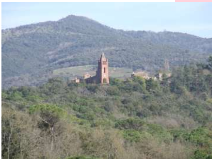
Classic Montanya.. The Church at El Brull