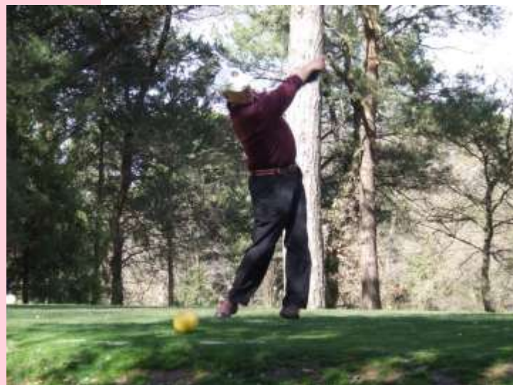
So we took two on the trot.