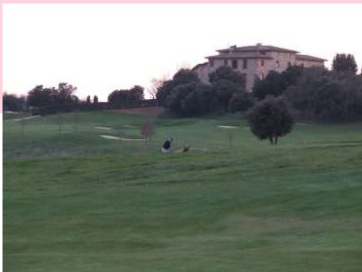
..and the clubhouse at dusk.