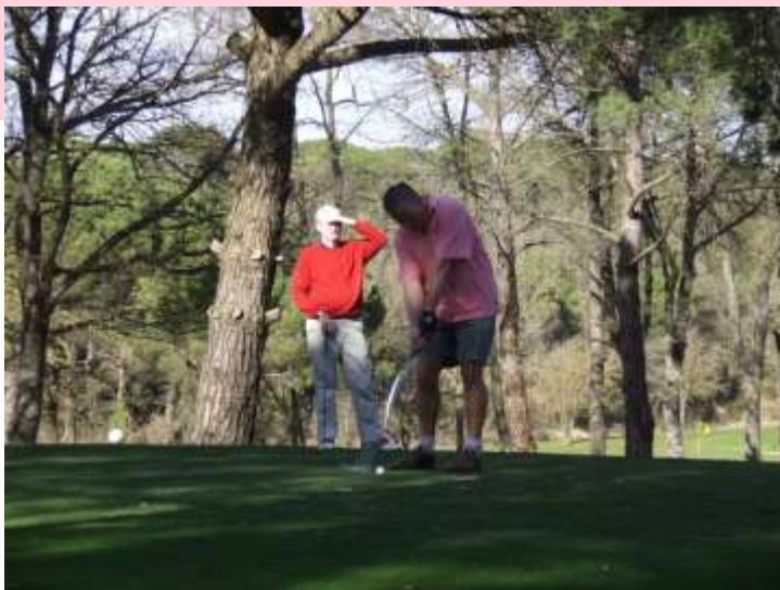
Kev givin it a tonk.. Good head down shot.